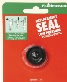
Low pressure seal